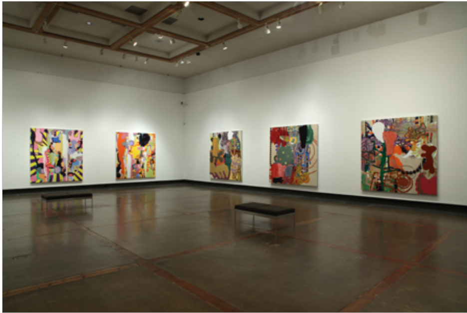
"John Kissick: A Nervous Decade" 2010 Installation view