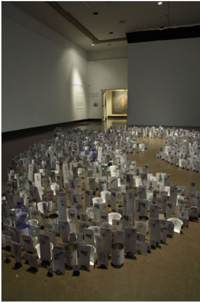
"Gwen MacGregor: Research, Flow Charts and Data Banks" 2010 Installation view

Subscribe to Canadian Art today and save 30% off the newstand price.